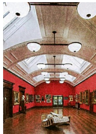
The Treasure House