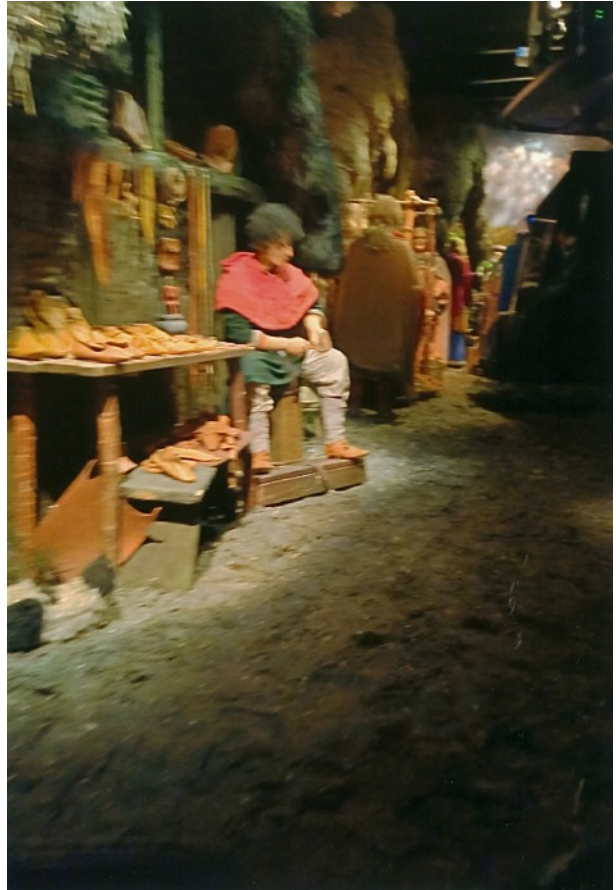
The Jorvik Centre, where the Vikings lived in York