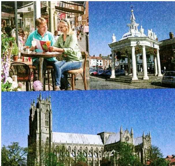
In Beverley Minster at a craft show with Music and Dancing