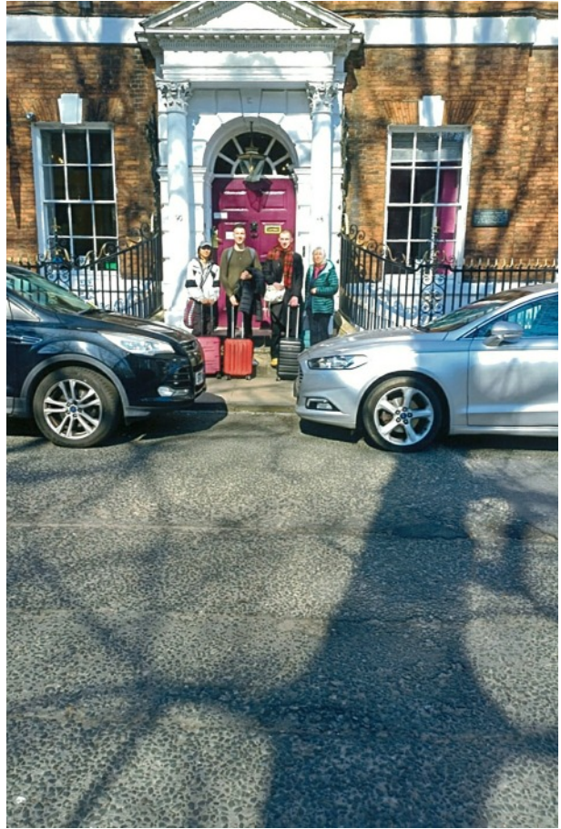
Youth Hostel Arrivals