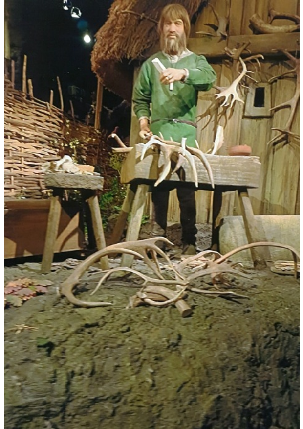
Viking models showing their crafts