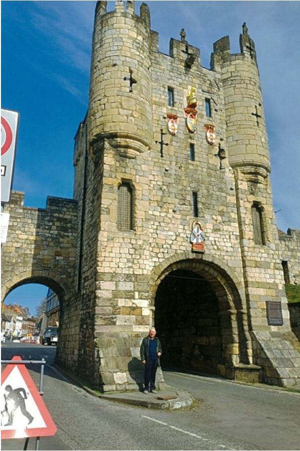
York - Micklegate Bar