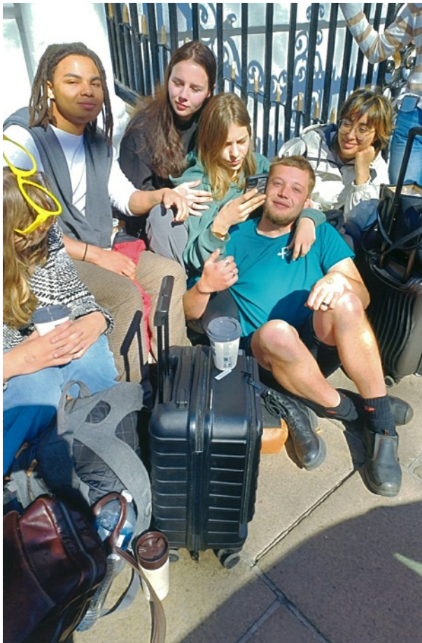
Some more relaxed!