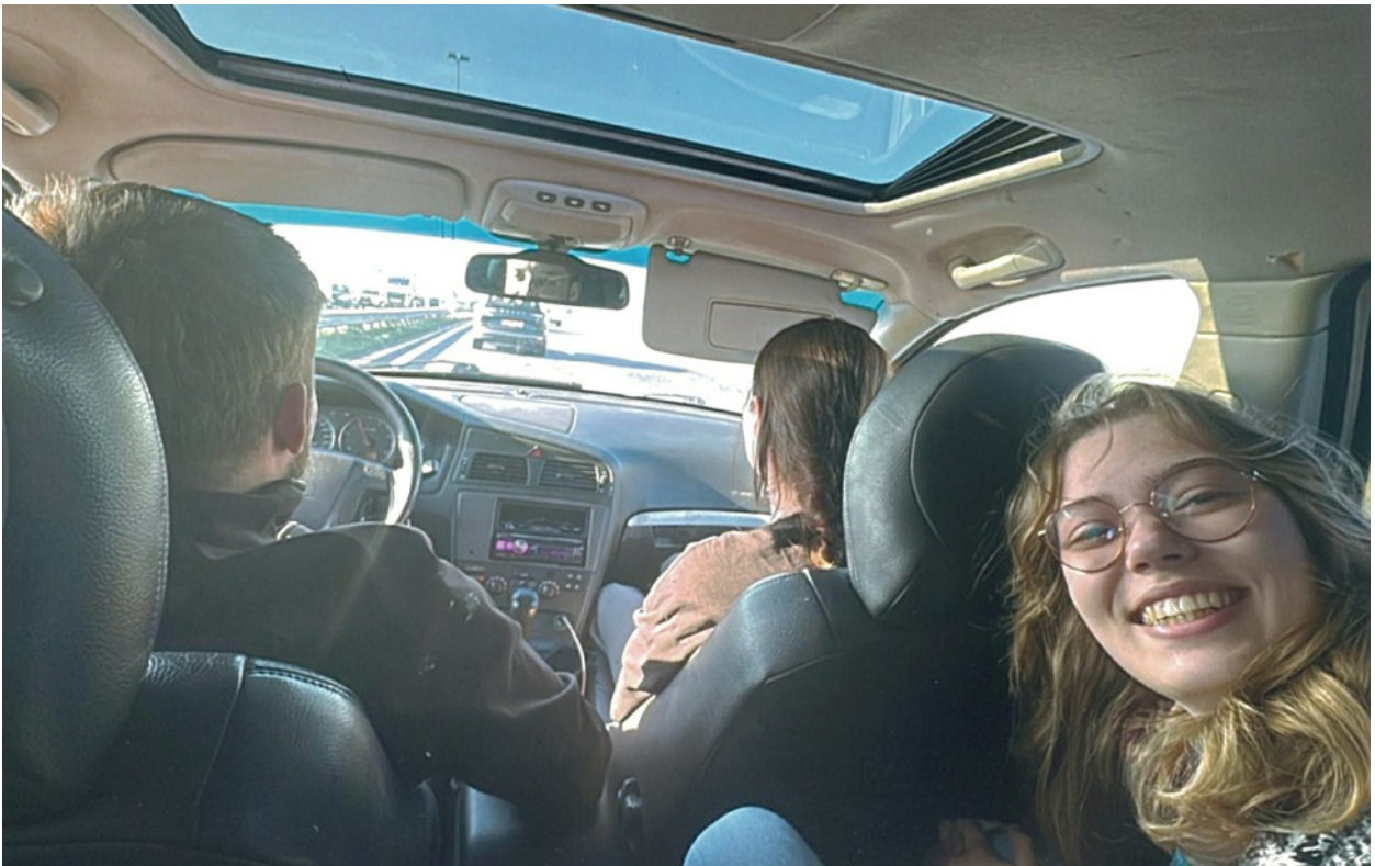
The Dutch contingent arriving by car